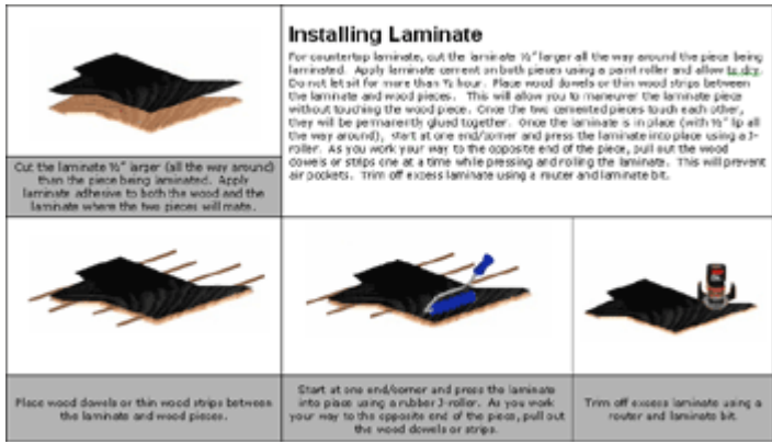
Need to Learn How to Apply Laminate?